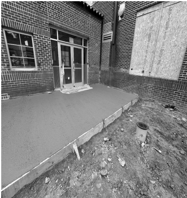
Formed and poured sidewalk at playground area