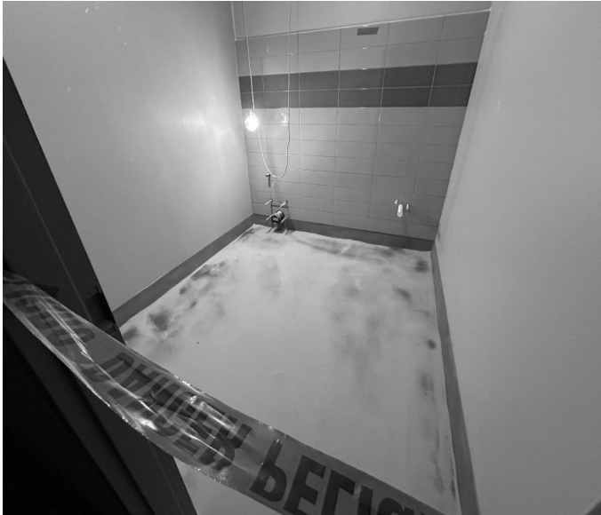
Continue with resinous flooring work