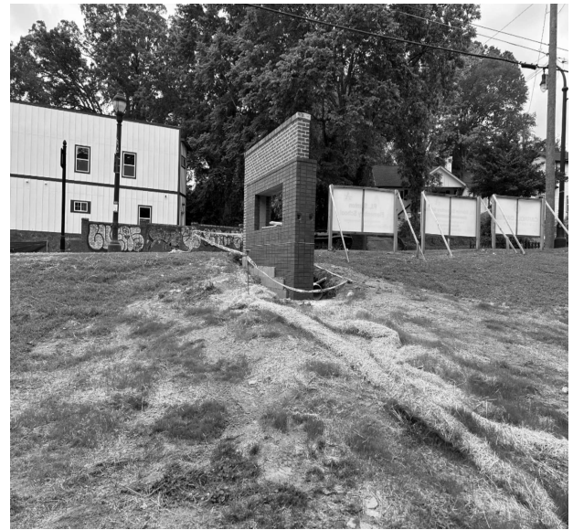
Monument sign complete, and currently ready for LED boards.