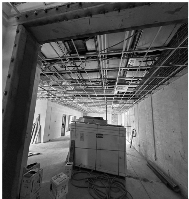
Continue with ceiling tile install